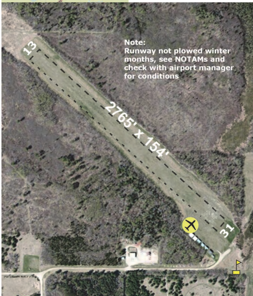
Remer Municipal Airport