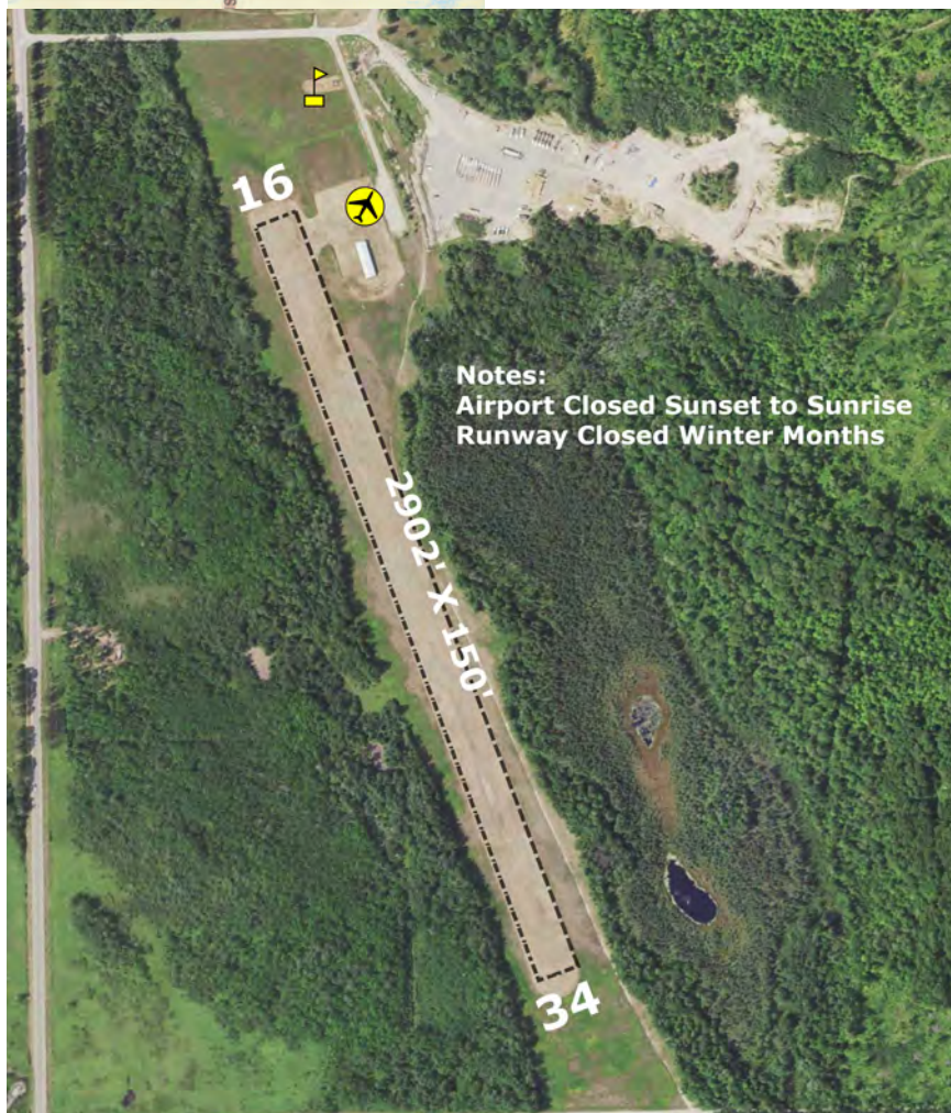
Hill City-Quadna Mountain Airport